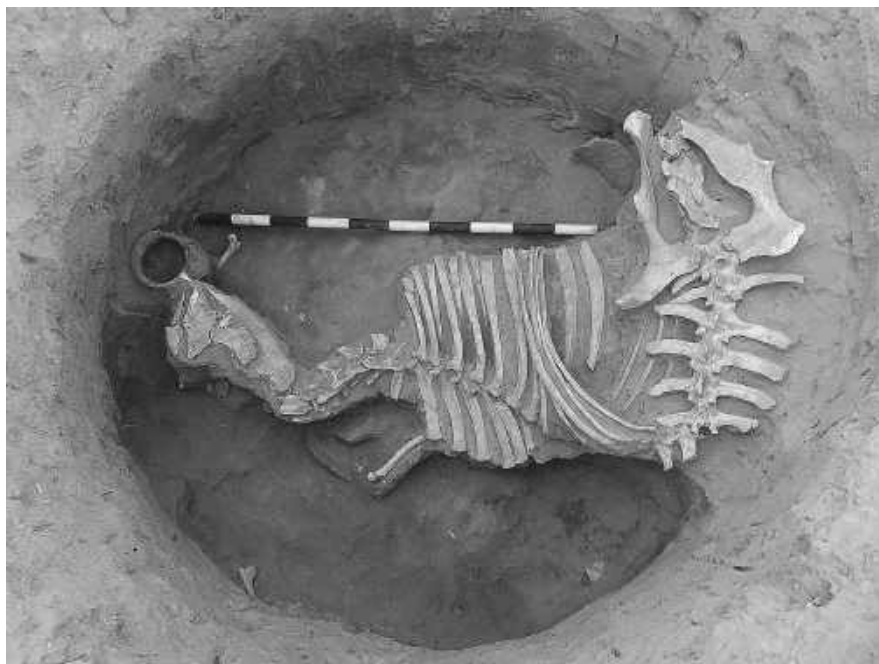
Fig.3. Pit no. 89. Cow skeleton