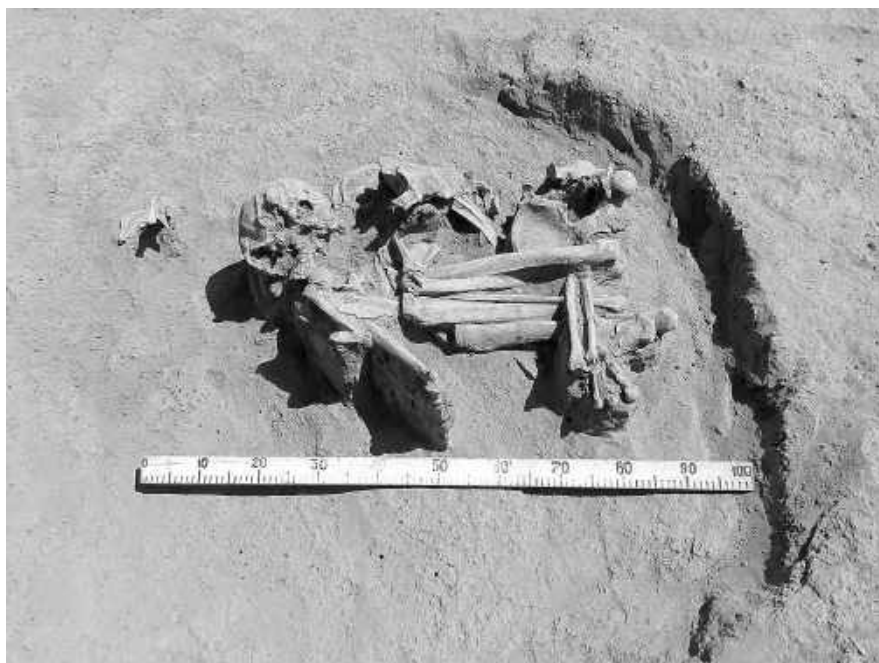
Fig.4. Pit no. 87. Human remains