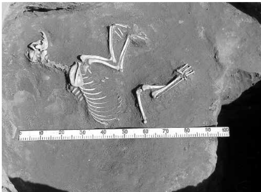
Fig. 1. Pit no. 69. Dog skeleton