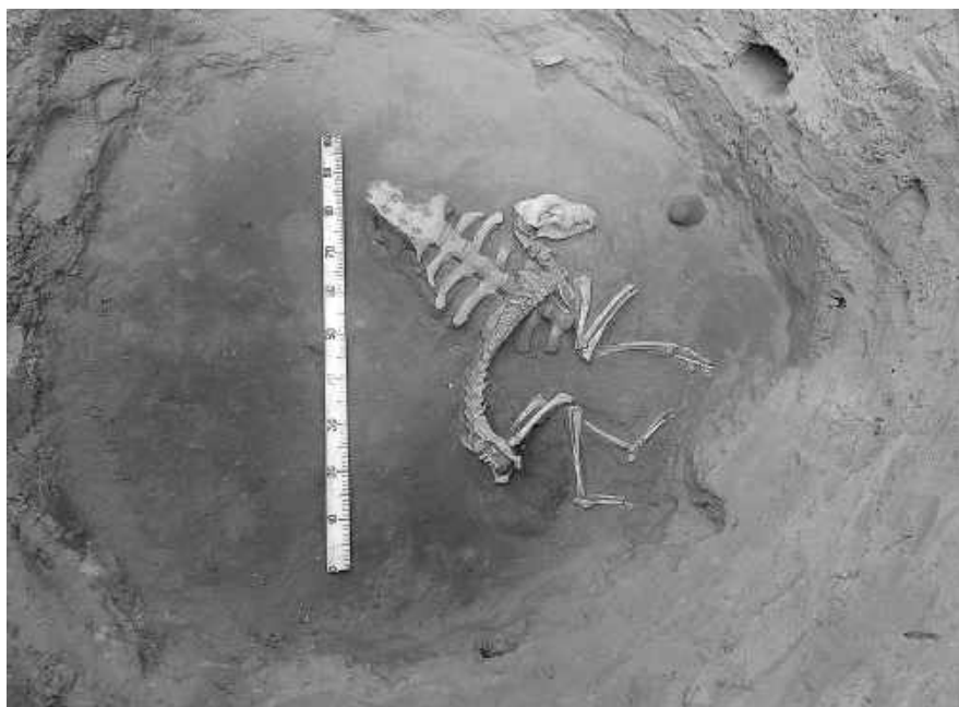
Fig. 2. Pit no. 80. Dog skeleton lying on a piece of a cow's vertebral column