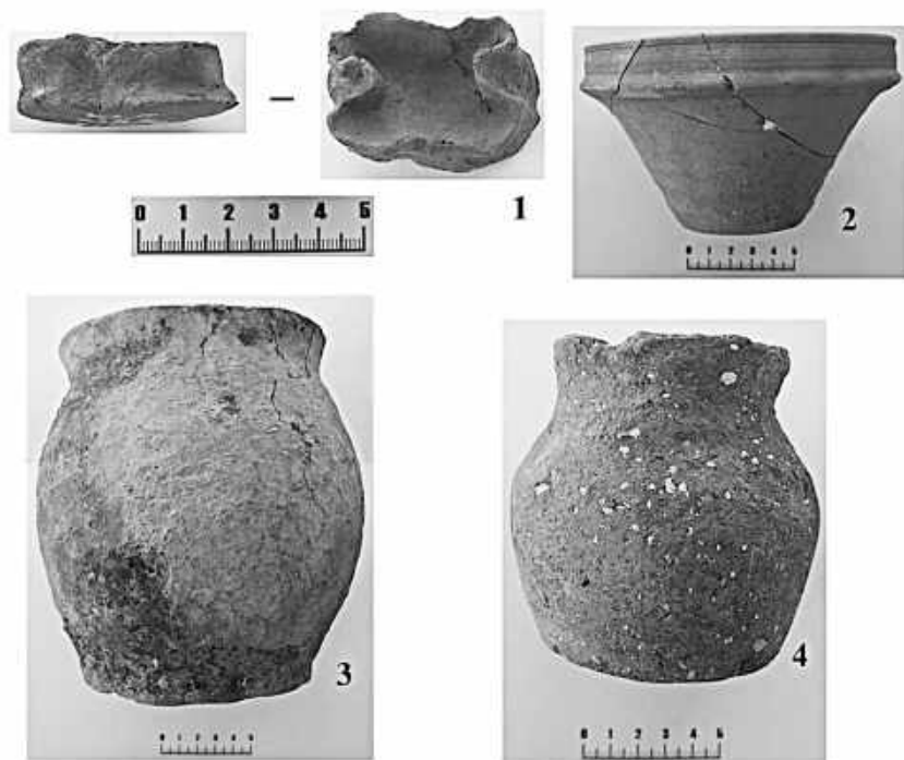
Fig. 5. Pottery finds from the pit no. 89